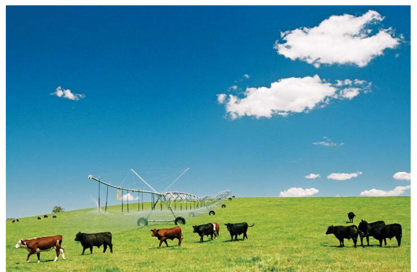
At Bobadeen, five electric powered centre-pivot irrigators pump mine water over 242 hectares of land planted with perennial pastures.