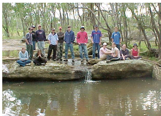
Students from the local area participated in the Duke of Edinburgh Qualifying Expedition at Ulan.

During October last year, Ulan Coal hosted its first Red Hill Environmental Education Centre tour - a Duke of Edinburgh Qualifying Expedition. Fifteen Year 9 students from the local area undertook a 20 kilometre, two-day walking expedition along Ulan Creek (from Ulan Coal's offices up towards the Bobadeen Irrigation Scheme) and finishing at Bobadeen Station. We will continue our active involvement with the Centre and remain a part of the Centre's regular curriculum.